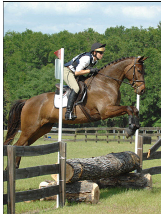
Heister, dam by Windfall. Won his first event and qualified for the 4yo Young Event Horse championships with one score.