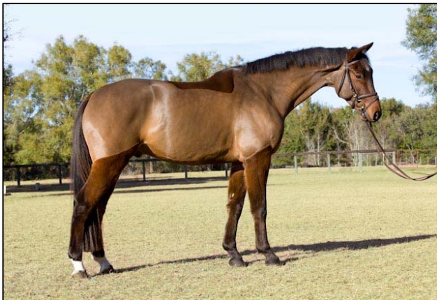
Herrmann, dam by Windfall. Multiple winner in eventing and dressage