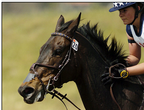
Astro, dam by Amethyst. 2x Young Event Horse Champion