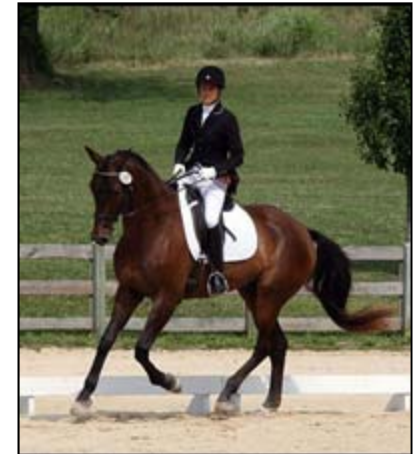
Honor, dam by Amethyst. Scores up to 74% (TL)