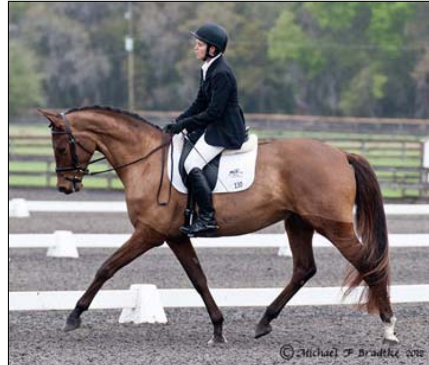
Akrobat, dam by Avignon II.